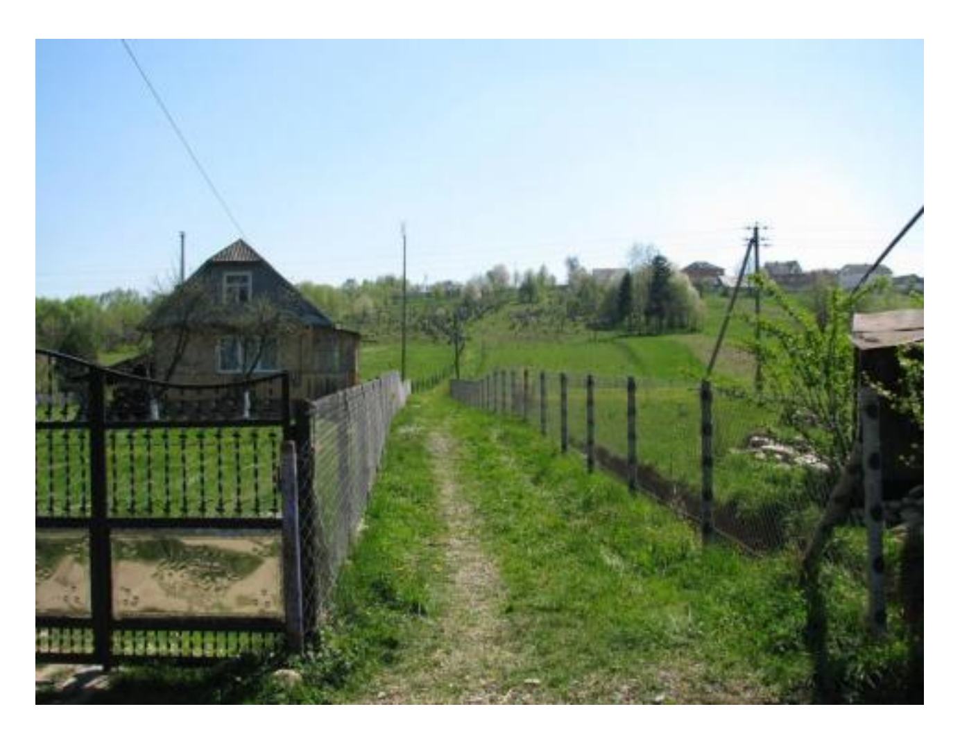
A view of the Solotvin cemetery from far