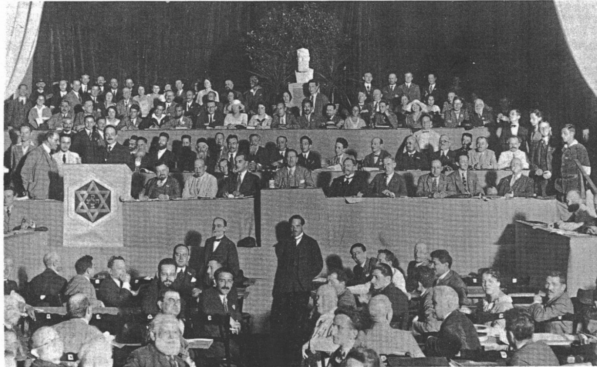
Figure 4. Presidium and executive of the World Zionist Organization at the Thirteenth Congress, Carlsbad, 1923. Seated in front row, left to right: Meir Berlin (Bar-Ilan), Chaim Weizmann, Shemaryahu Levin, Nahum Sokolow (chairman), Leo Motzkin, Louis Lipsky, Eliezer Kaplan, Yizhak Ben-Zvi.