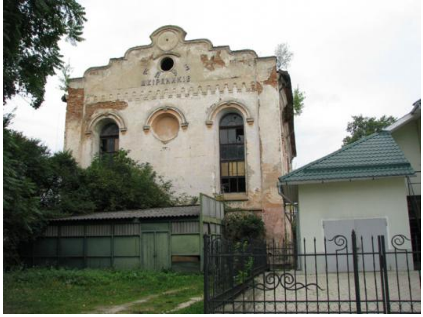
<u>Previous Pause Next</u> <u>The greate synagogue in Bolechow - eastern facade</u>

The greate synagogue in Bolechow - southern facade