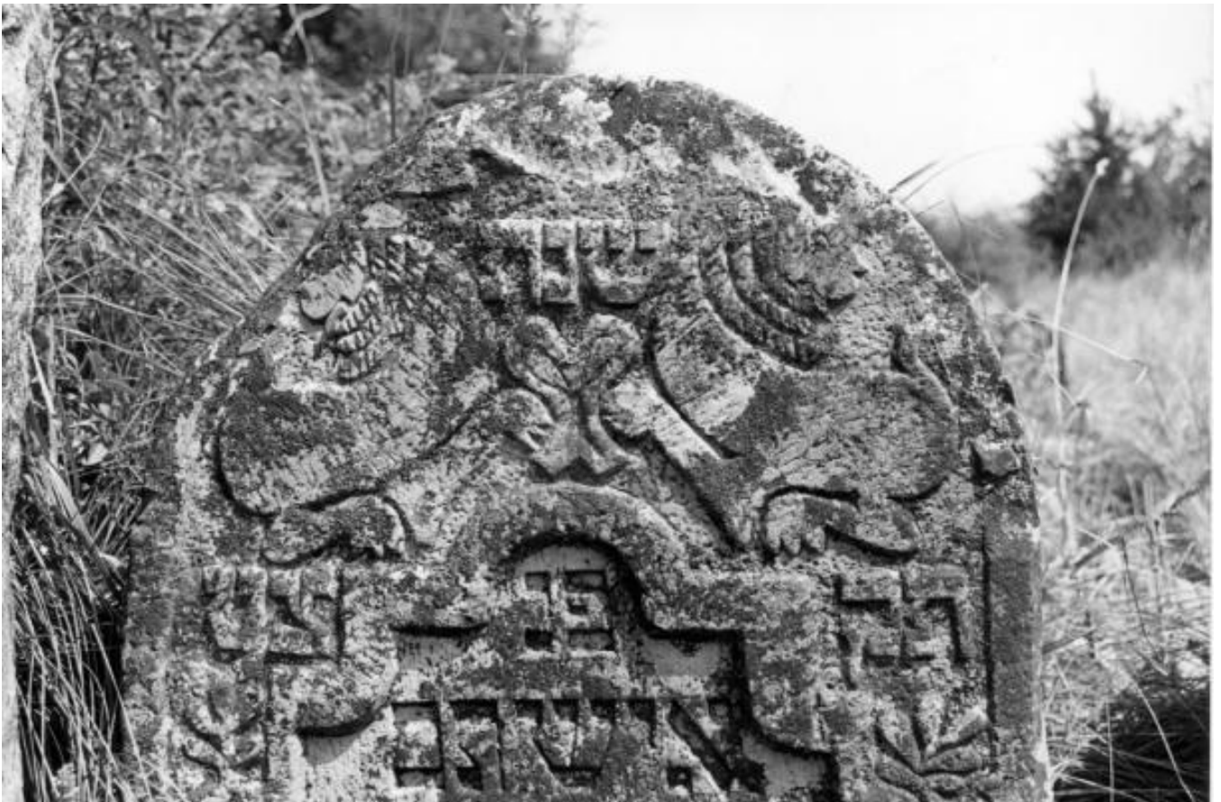
Solotvyn cemetery. tombstone H088c (1999) detail