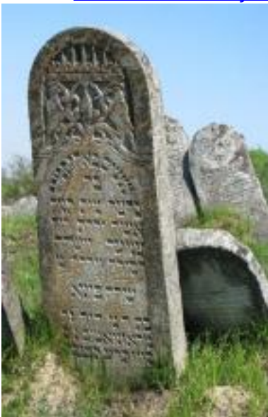
Solotwin cemetery, tombstone C092 (Apr. 2009)