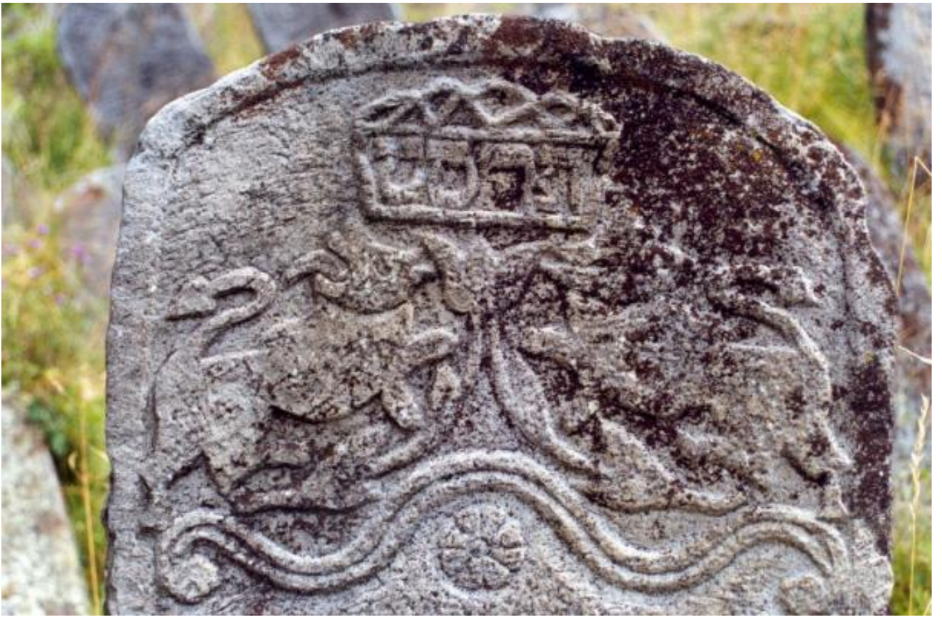
Solotvyn, Miller's House