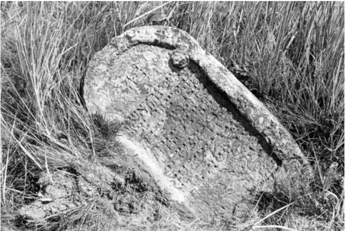
Igel family - Solotvyn