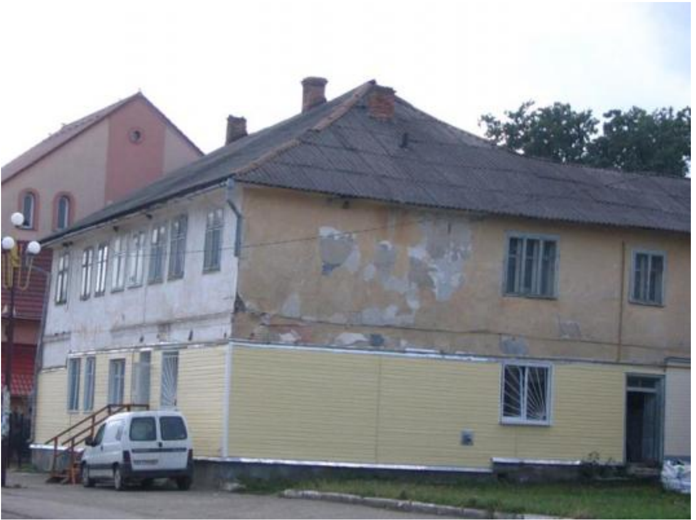
Solotvyn, House of Kuker 01