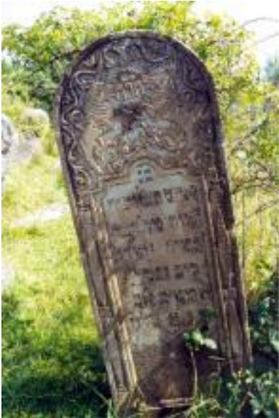
Solotvyn cemetery, tombstone D094