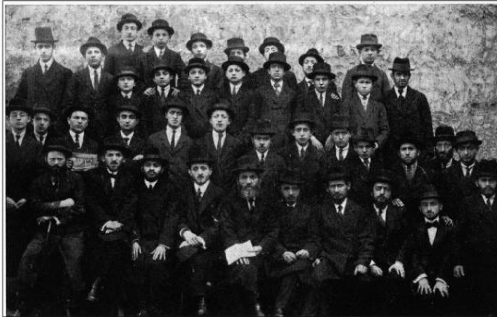
„צעירי המזרחי“ בשנת 1922