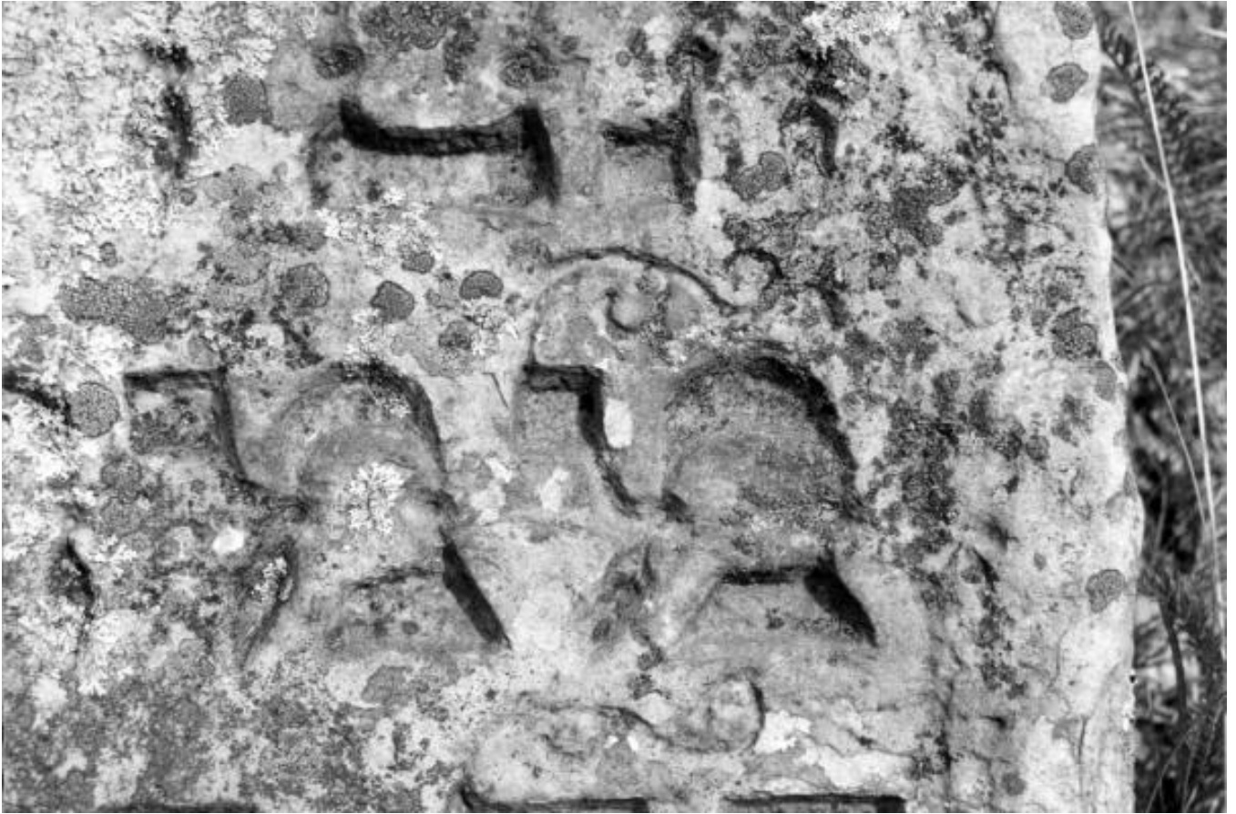
Solotvin, A Place of a Jewish Eggs Seller