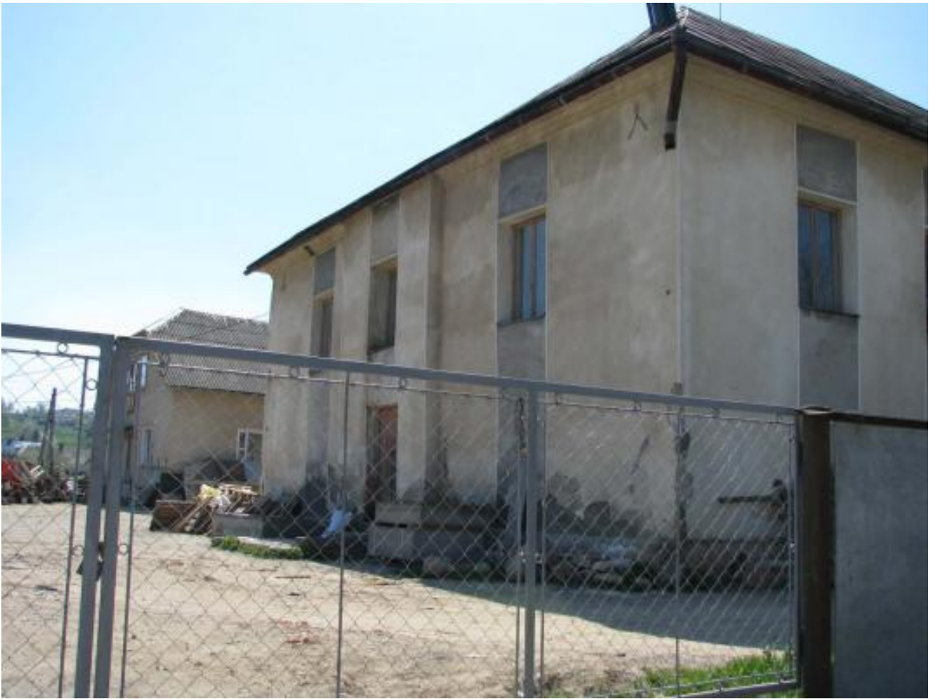
Solotvyn, Miller's House