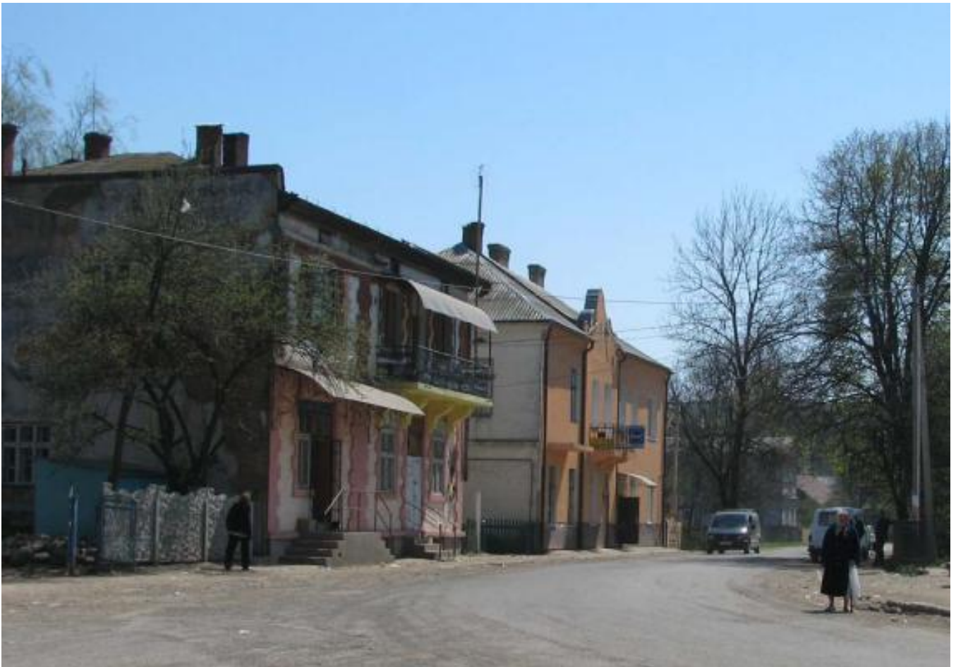
Solotvyn, Former Jewish Houses (marketplace)