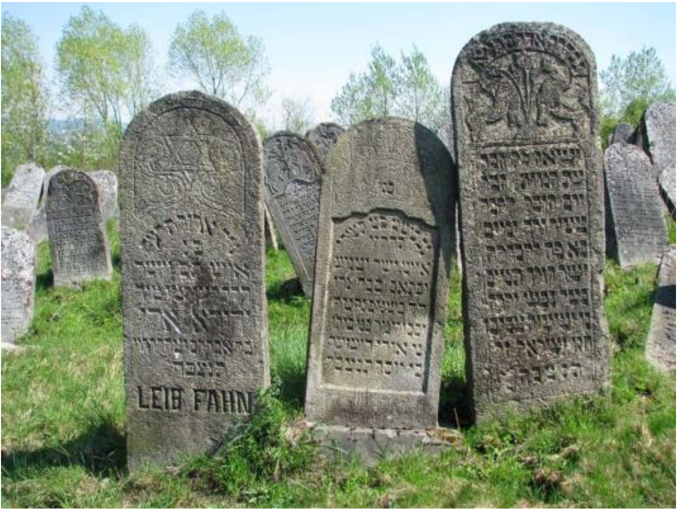
"Zeirei Hamizrahi" in 1922