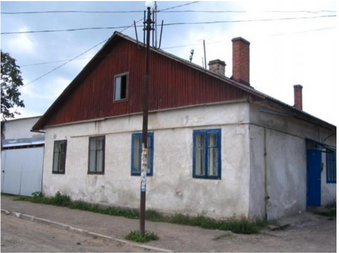
Synagogue in Solotwin

Published on Єврейська Галичина та Буковина ( http://jgaliciabukovina.net )