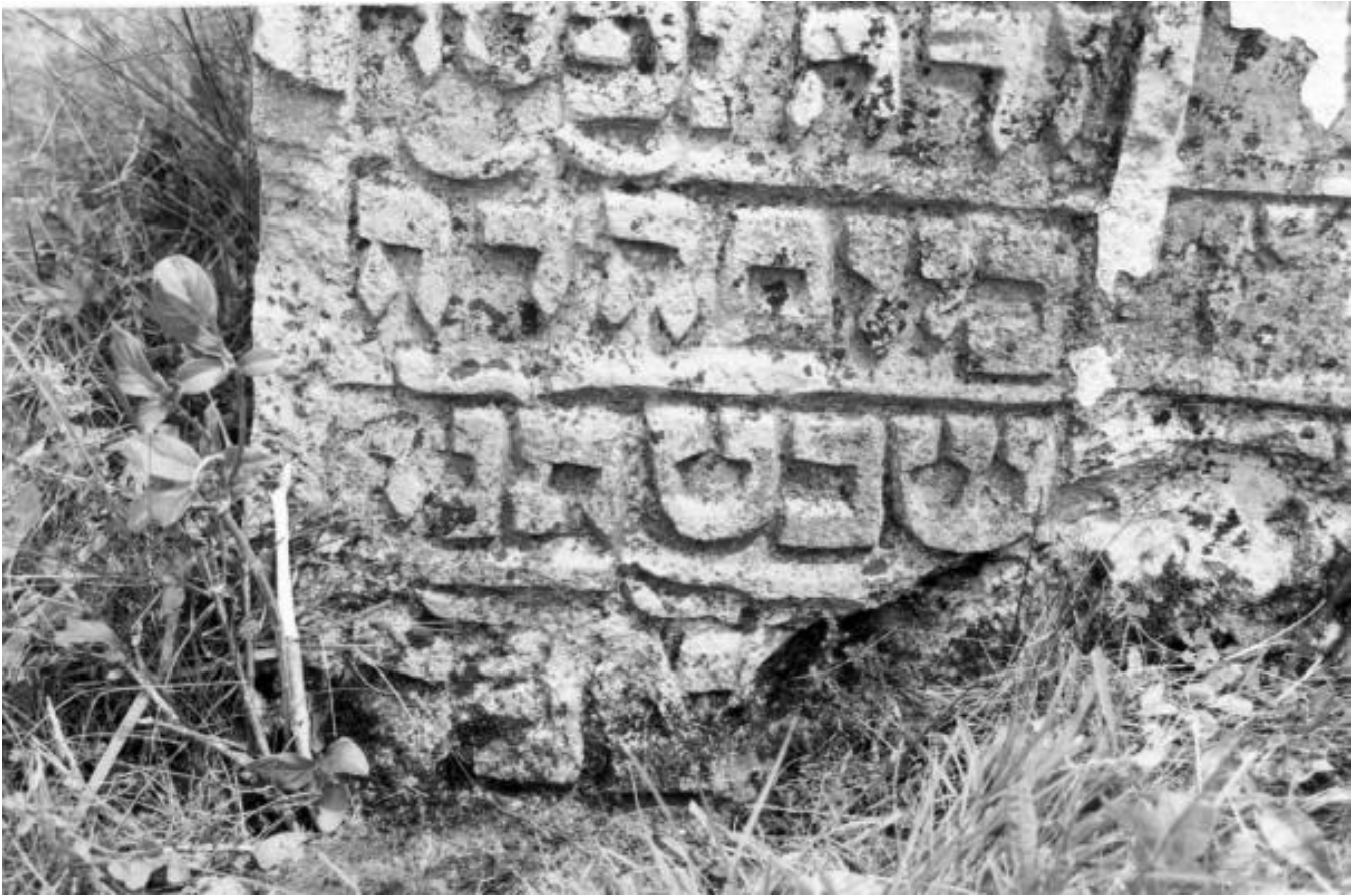
Solotvyn, House of the Lawyer Chernenko