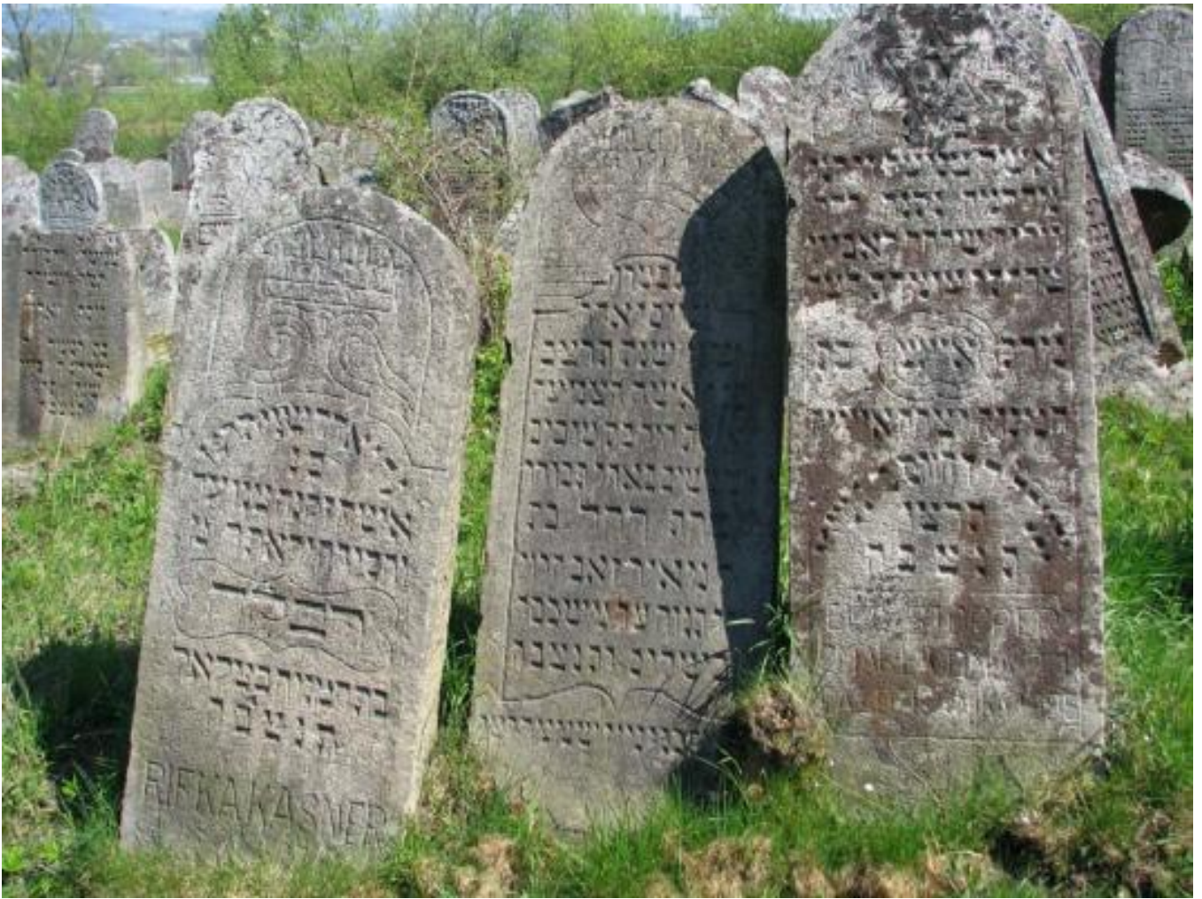
Solotvyn cemetery, tombstone