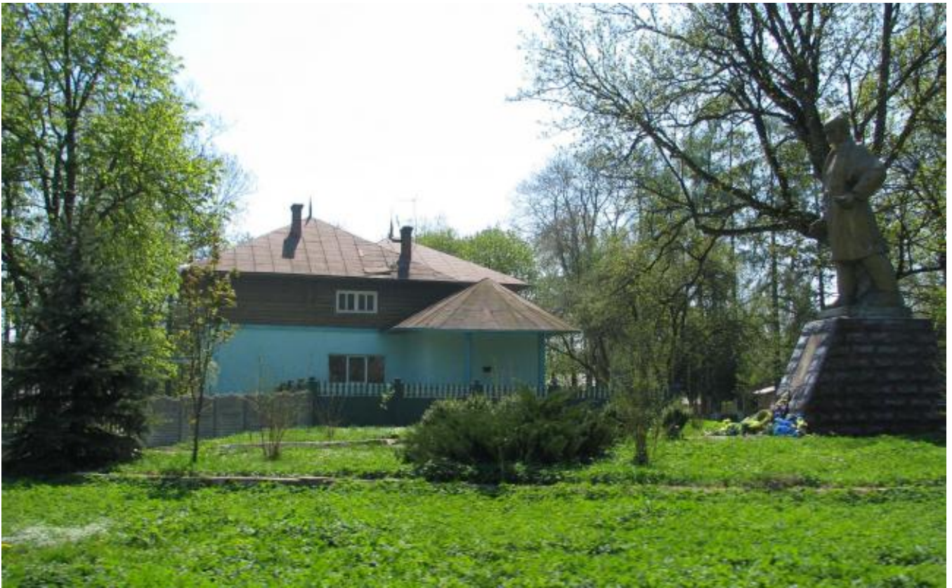
Solotvyn - pre-WWII photograph