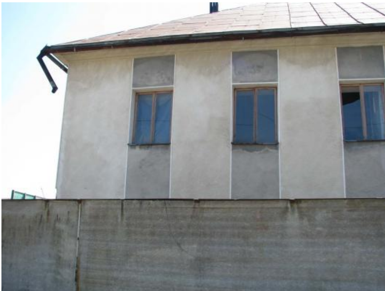
Solotvyn, Coat of arms