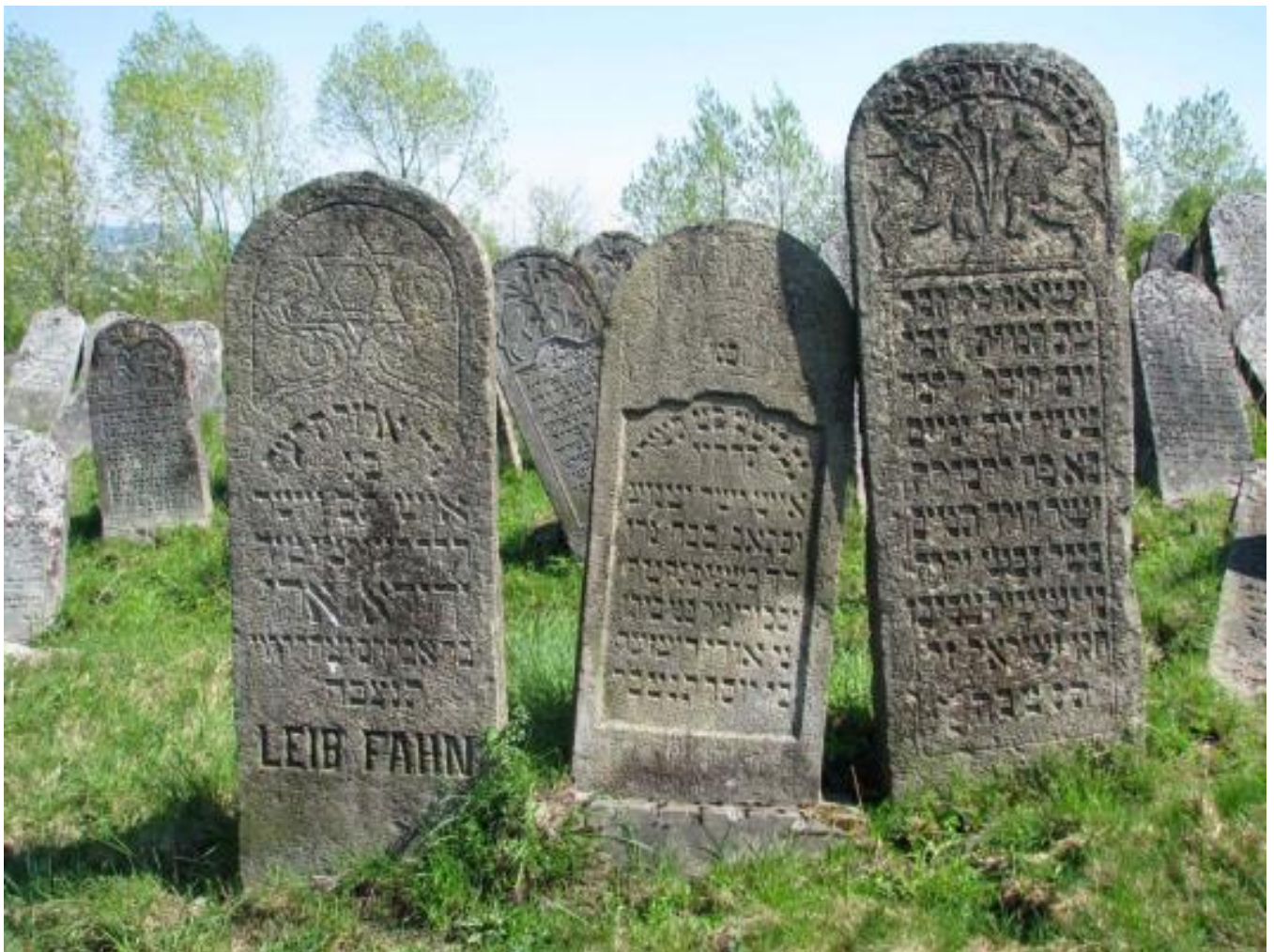
Solotvyn cemetery, tombstone A1.28b