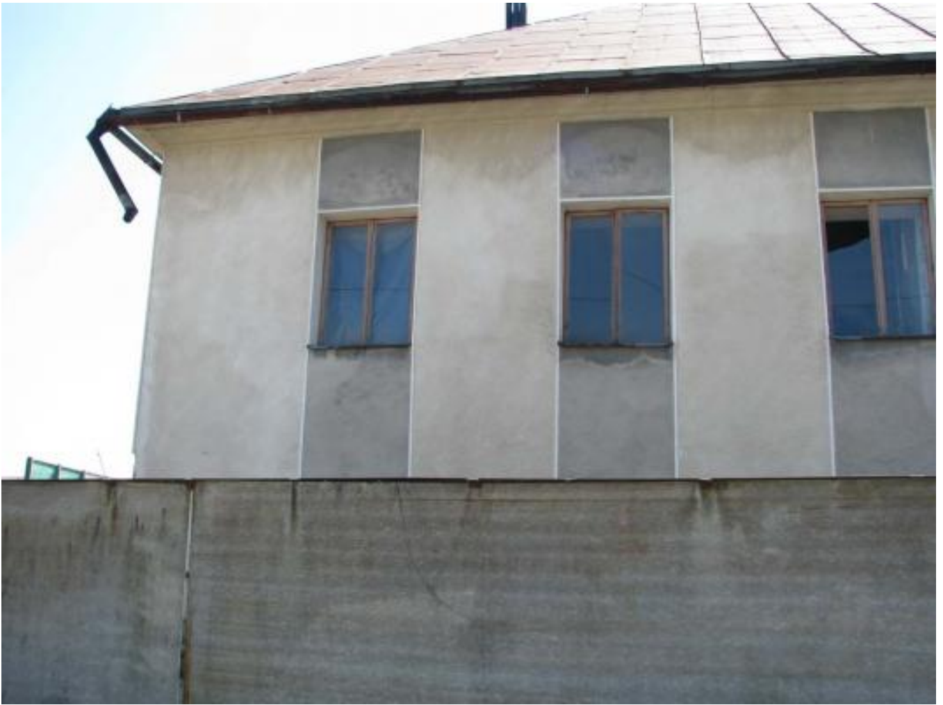
Solotvyn, Former Jewish House - 2