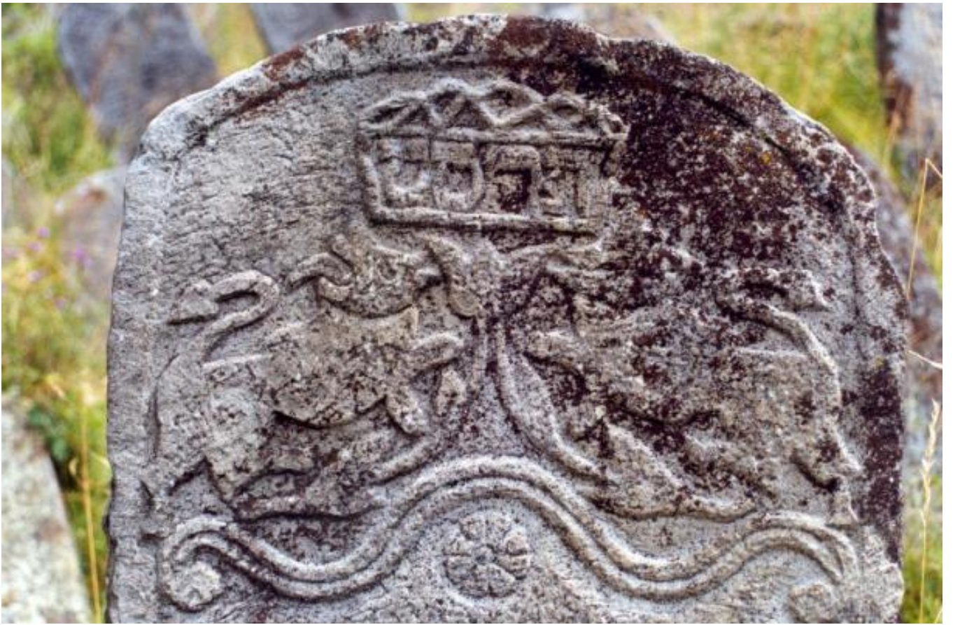
Igel Family - Solotvin