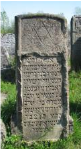
Solotvyn cemetery, tombstone F146