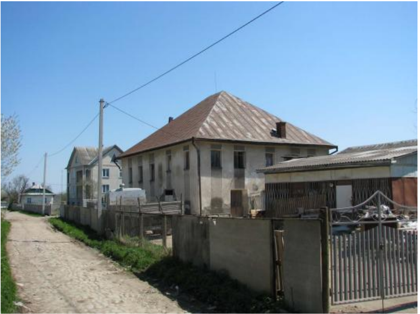
Solotvyn, Former Jewish Shop