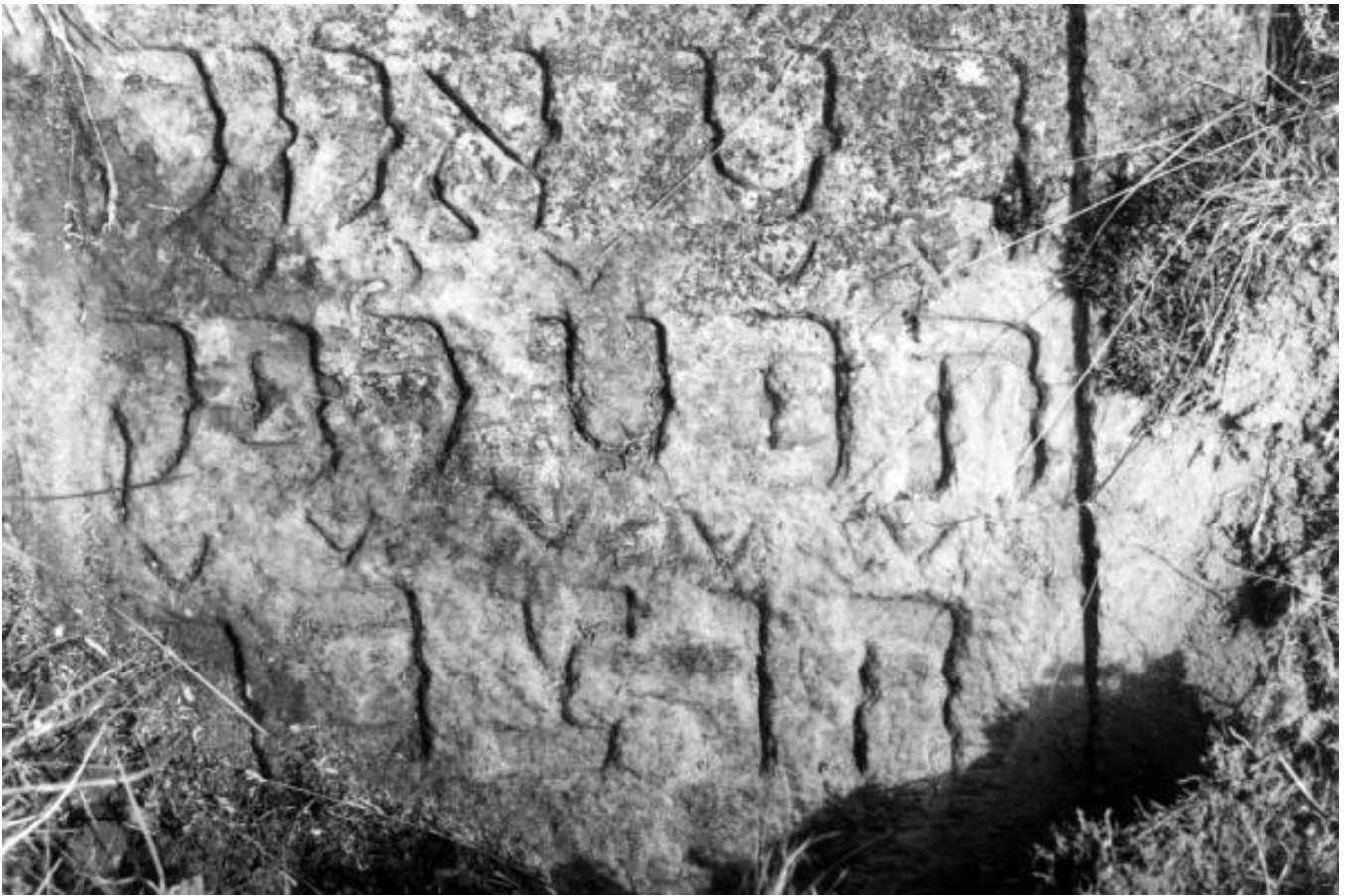
"Zeirei Hamizrahi" in 1922