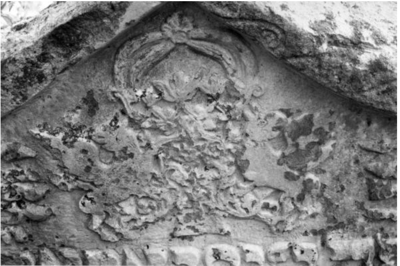
Solotvyn, House of Doctor Tyger II