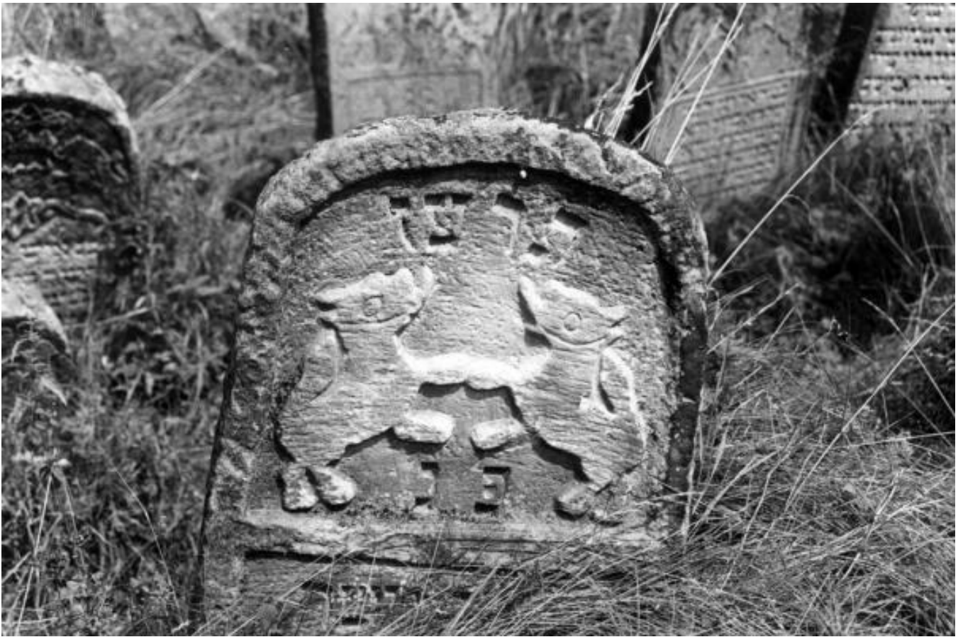
Solotvyn cemetery, tombstone K054b