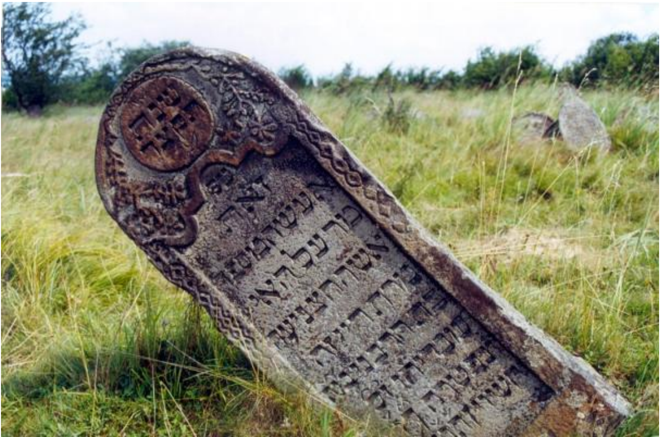
Solotvyn cemetery. tombstone H085