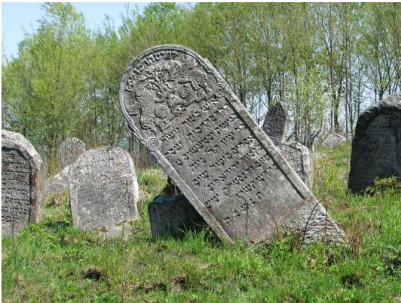
Solotvin cemetery, tombstone L071c detail