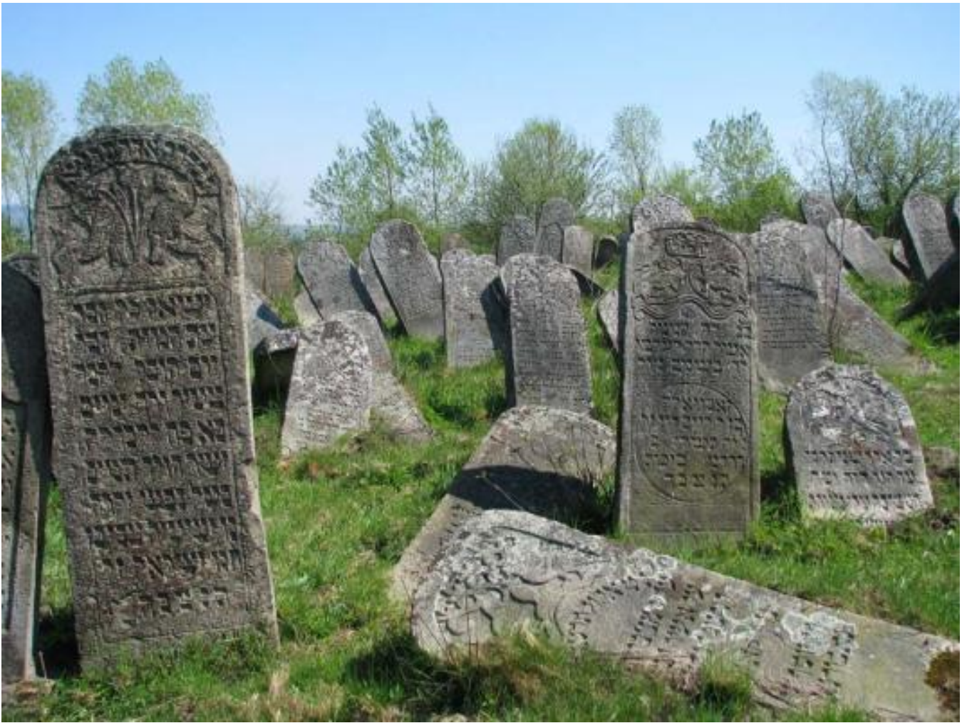
Solotvyn cemetery, tombstone