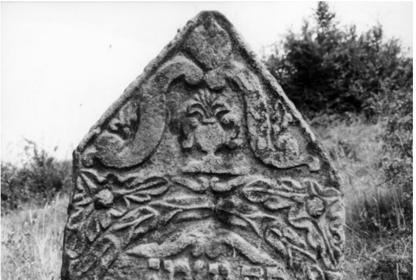
Solotvyn, Class Photograph 1937