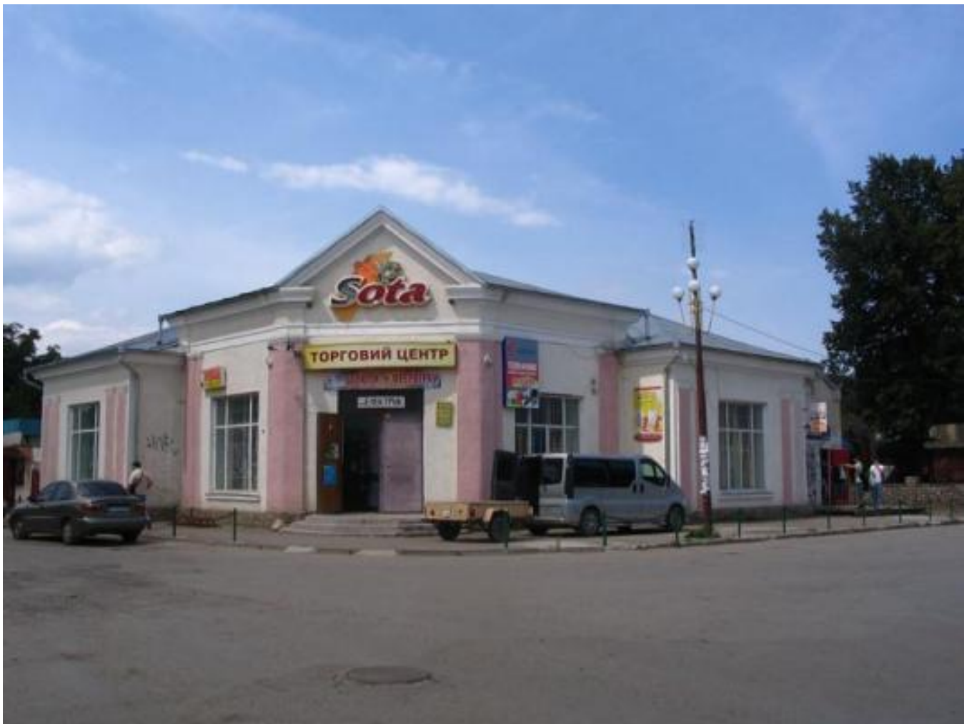
Synagogue in Solotwin