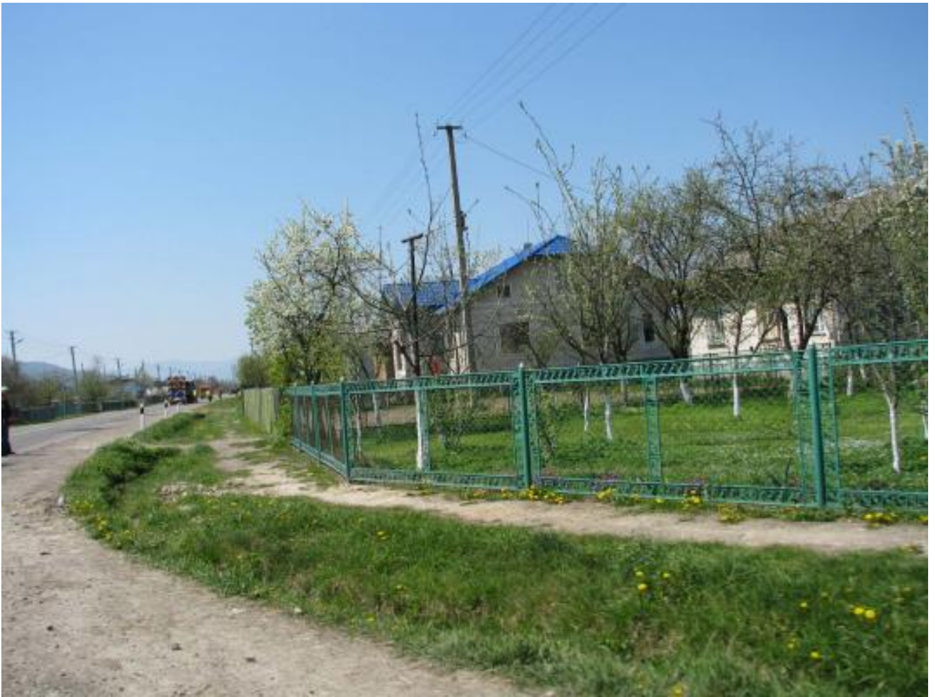
Solotvyn, House of Doctor Rubel