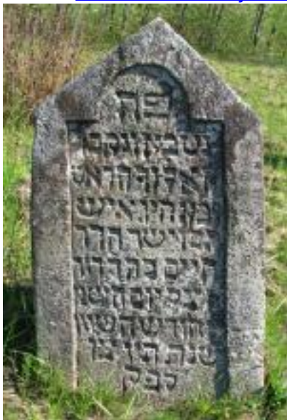
Solotvyn cemetery, tombstone M009 (Apr. 2009)