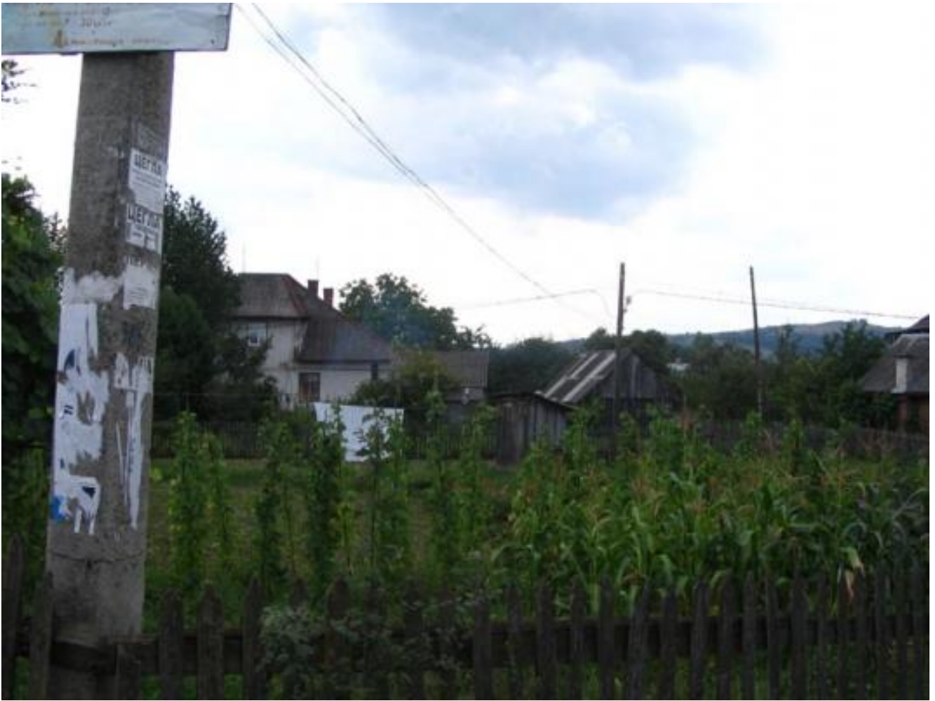
Solotvyn cemetery, tombstone H085