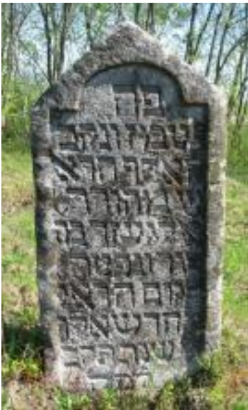
Solotvin cemetery, tombstone K049