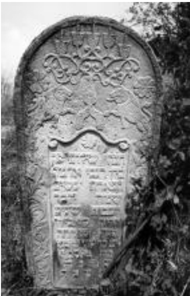
Solotwin cemetery, tombstone F104 (1999)