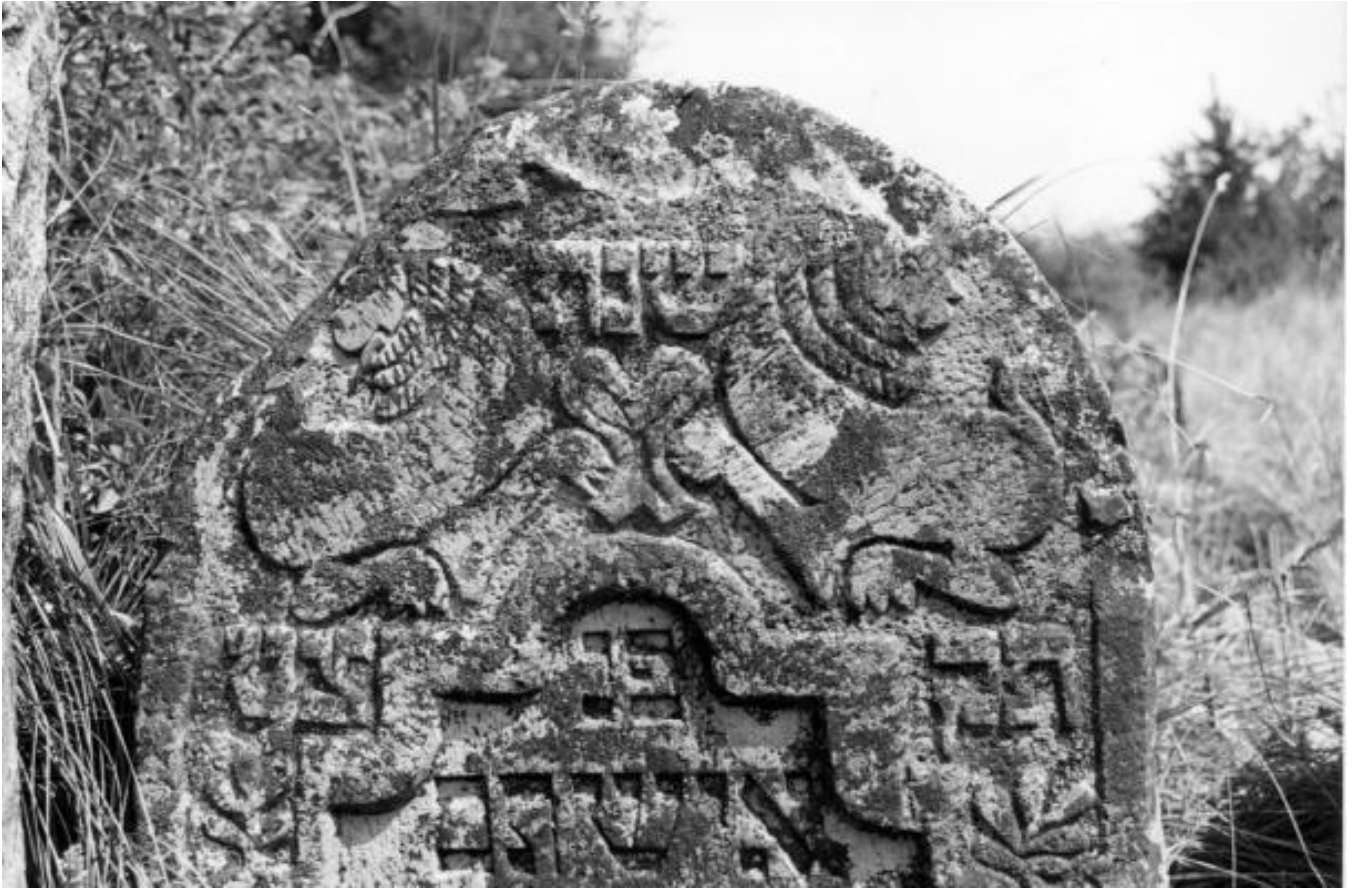
Solotvyn cemetery. tombstone H088c (1999) detail