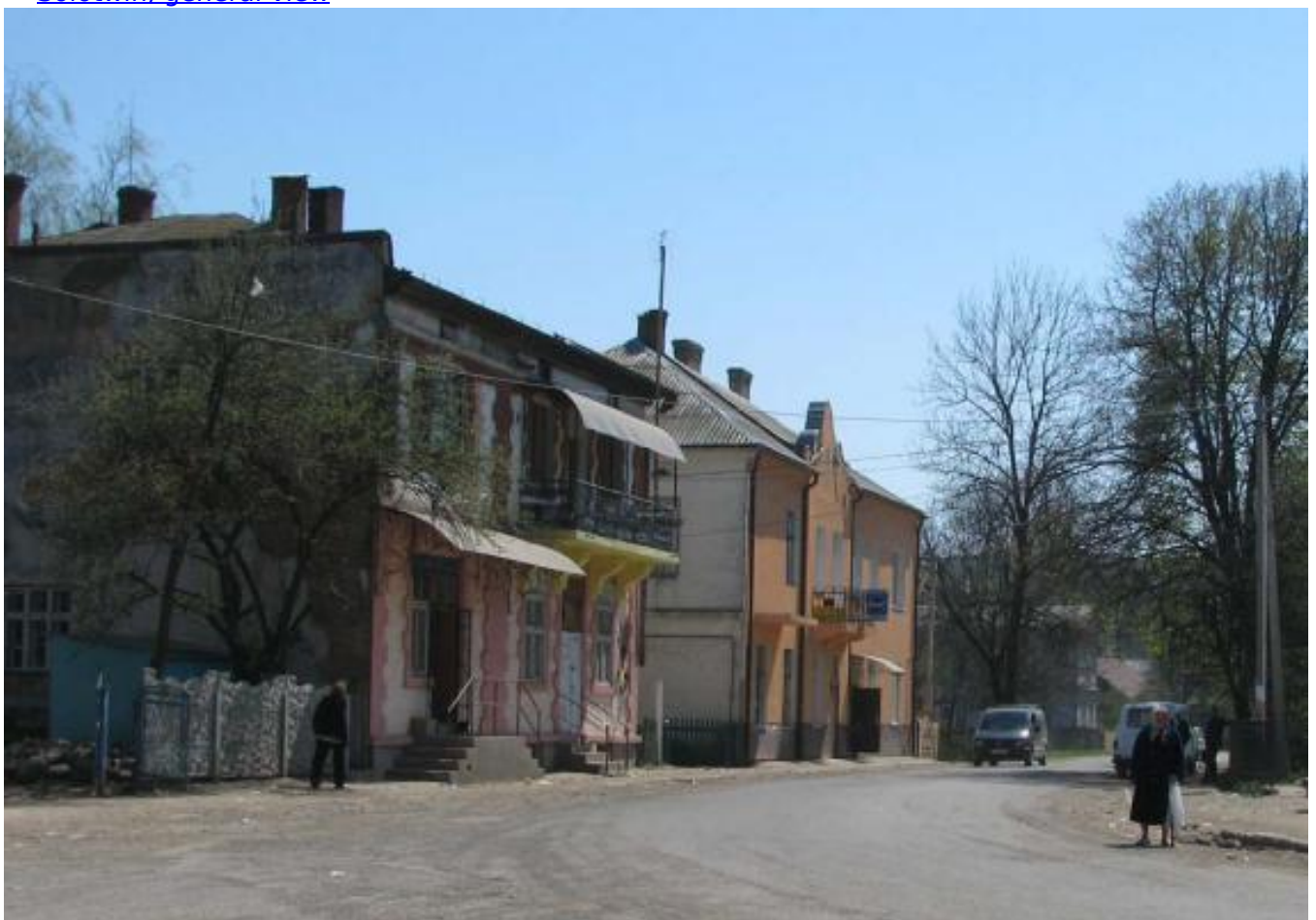
Solotvin, Former Jewish Houses (marketplace)