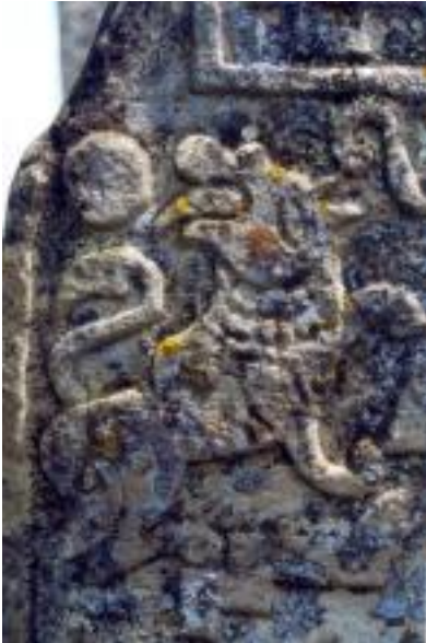
Solotvyn cemetery, tombstone K054