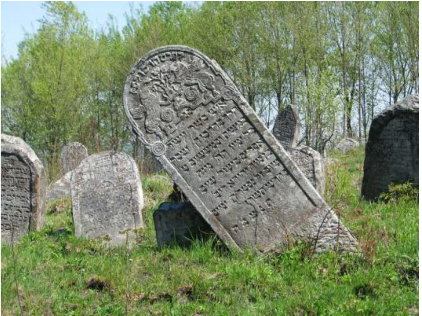
Solotvyn cemetery, tombstone L071c detail