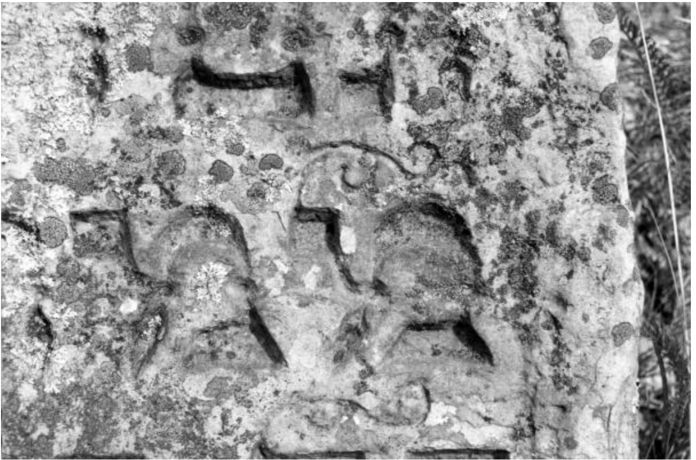
Solotvin, A Place of a Jewish Eggs Seller