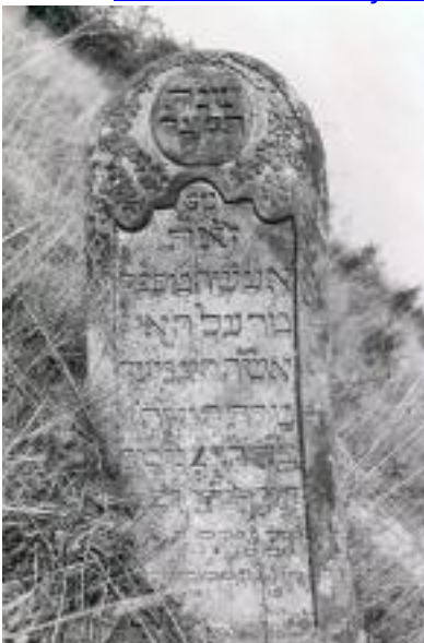
Solotwin cemetery, tombstone F146