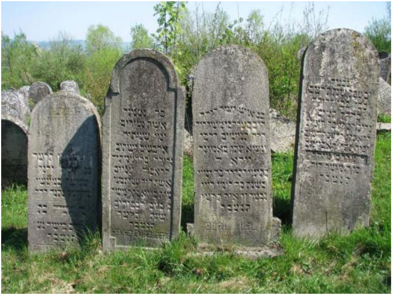
Solotvyn cemetery, tombstone A2.2b