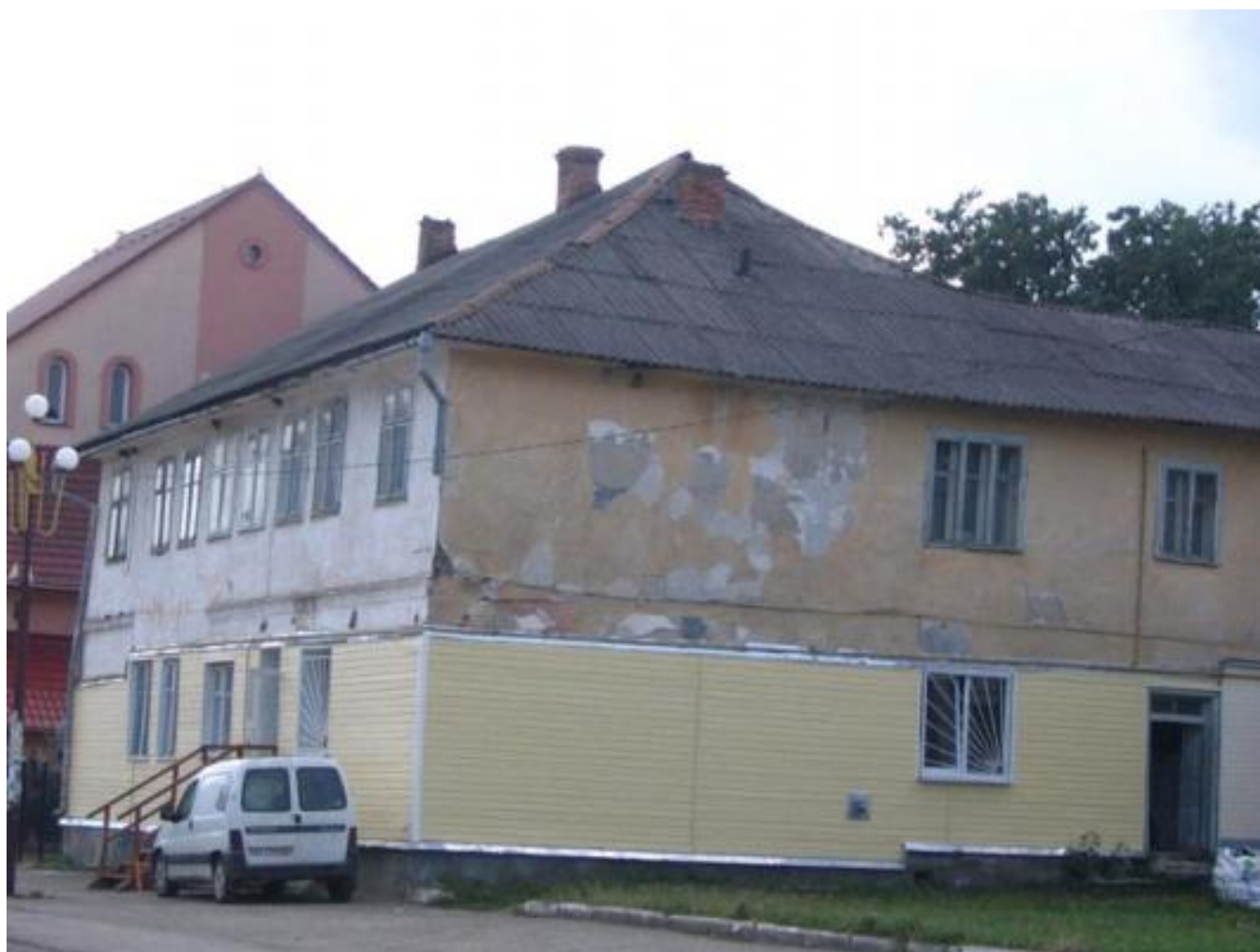
Solotvyn, House of Kuker 01